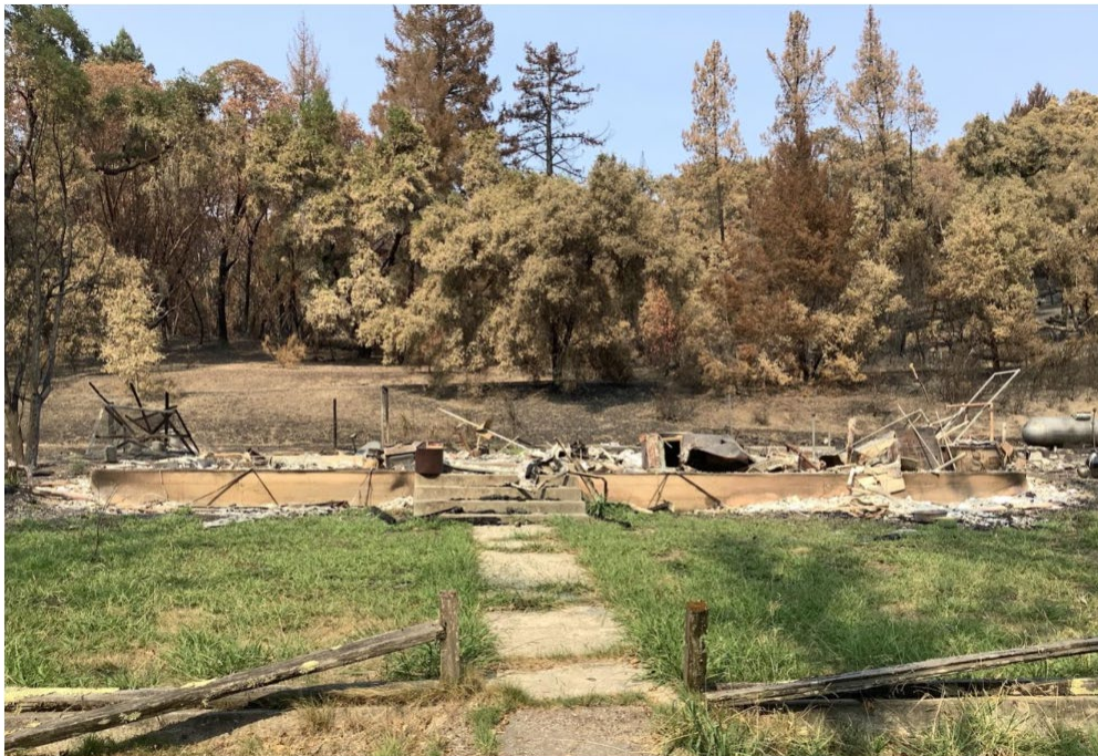
Figure 4: Residence 16 after the fire (located directly across from Residence 10), camera facing north. September 28, 2020. Nothing currently remains of these ruins.