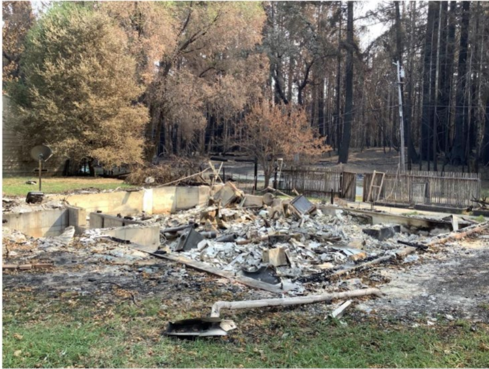
Figure 3. Residence 9 (the nearest residence to Residence 10) after the fire, camera facing southeast September 29, 2020. Nothing currently remains of these ruins.