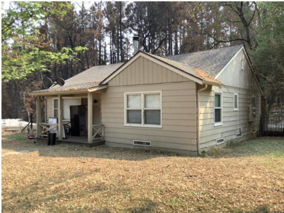
Figure 2. Residence 10 after the fire, camera facing southeast September 29, 2020.